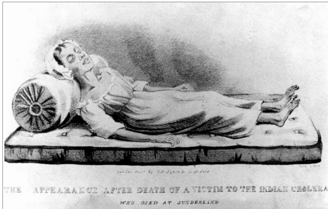
Figure 1 'The first victim to die of cholera in Sunderland'.