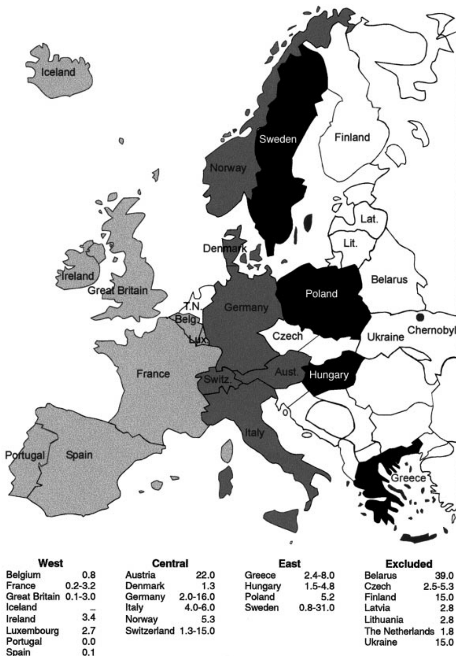
Figure 1 Map of Europe with the countries included in the synoptic model and population-weighted deposition of Cs-137. West - light, Central - medium, East - dark, White - countries excluded for none or incomplete data or unknown or changed stillbirth definition in 1980 to 1992

simple and contains only an intercept, time and time squared. The partial Western and Eastern European models are more complicated since only the effect variable for 1986 (West) and the cube of time (East) have been excluded. The final synoptic model has 15 variables that are the complement of the excluded six variables in Table 5 relative to Table 4. Since we have 39 observations (3 * 13) the error term of the model has 24 degrees of freedom (d.f.). The deviance is 16.03 and yields an upper tail \chi^2 probability of 0.8868, i.e. the data are not unlikely under